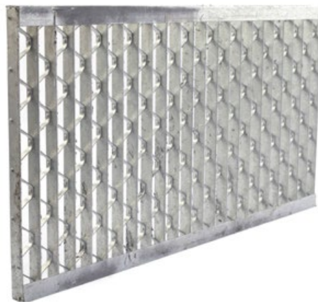
DITCH INLET GRATE - TYPE B