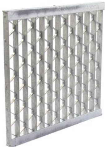
DITCH INLET GRATE - TYPE A